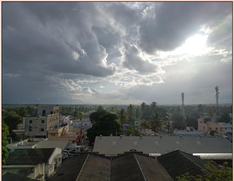
D ESWAR I-ECE