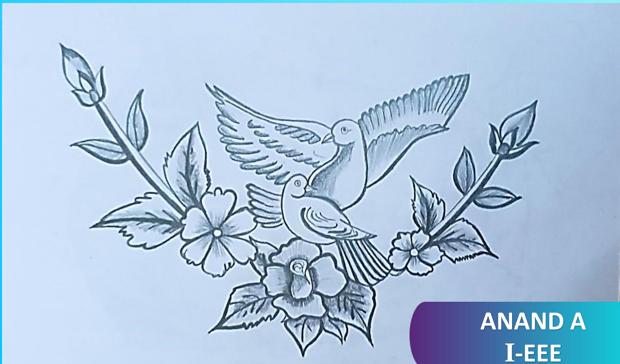
ANAND A I-EEE