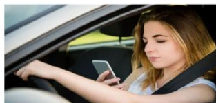
Figure 1.1. Distraction

Abstract - Driver distractedness and interruption are the primary drivers of street mishaps, a significant number of which bring about fatalities. At present, interruption location frameworks for street vehicles are not yet broadly accessible or are restricted to explicit reasons for driver distractedness, for example, driver weariness. Research endeavors have been made to screen drivers' attentional states and offer help to drivers. The current work of occupied driver recognition is worried about a restricted arrangement of interruptions (Mainly phone utilization). In this venture, a strong driver interruption discovery framework that extricates the driver's state from the accounts of a Windshield camera utilizing Deep Learning based Faster Region Convolutional Neural Network (FRGCNN). This venture utilizes the state ranch