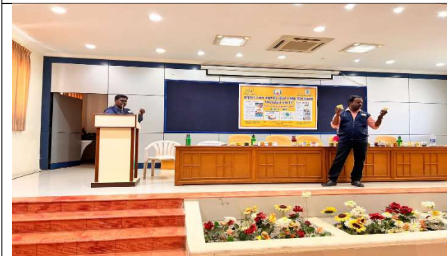
Food Safety officeres have explained the how to detect the adulteration by rapid tests