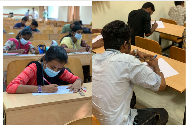
Showing how engineers can contribute it enormously comprising the topics