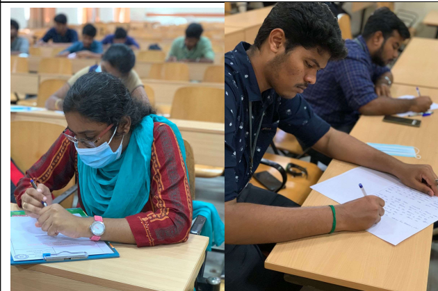
students showed up their knowledge in the way they see this enthusiastic world