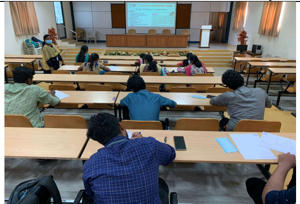
Students' ideas considering technology towards the consumers