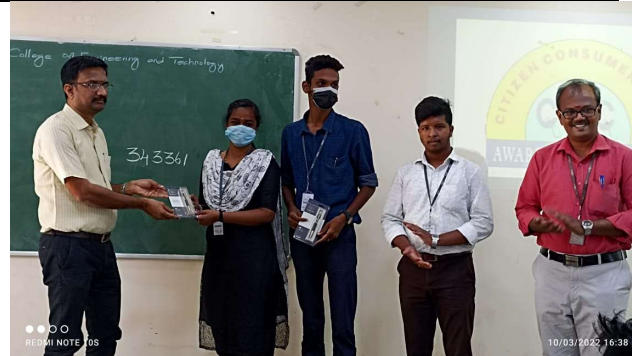
First Prize Winners