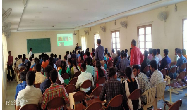
Round 1 & 2