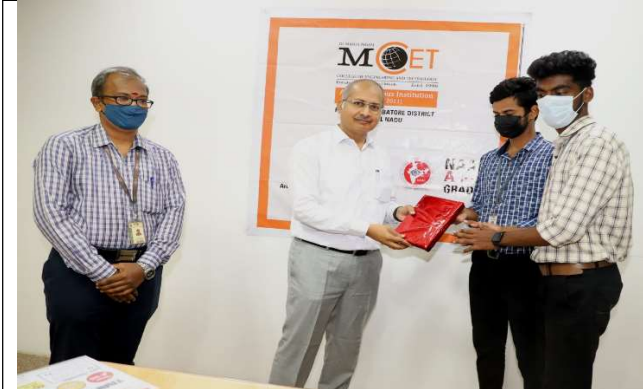
Second Prize Winners