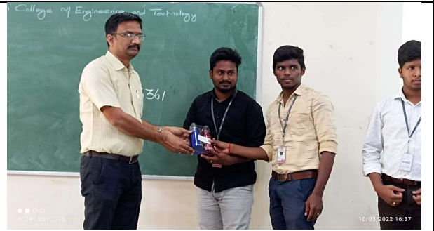
Third Prize Winners