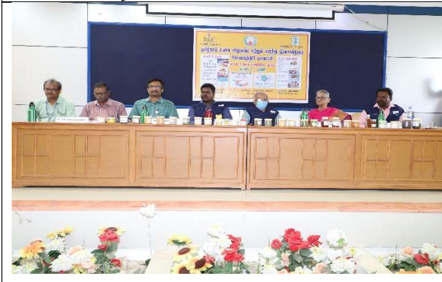
Dignitaries on the dais