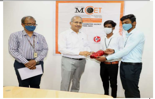
First Prize Winners