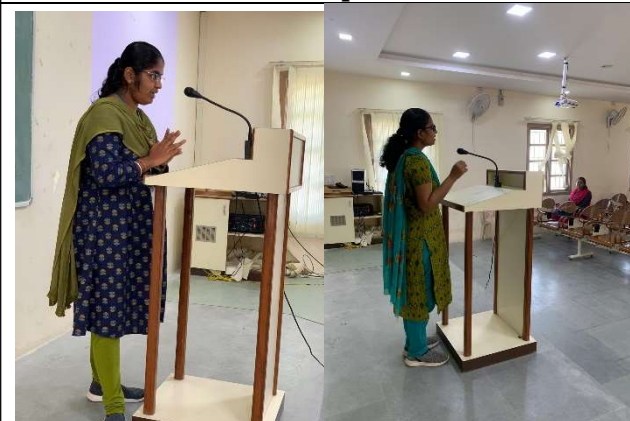
Students had put their thoughts, insights, humour and delivered the speech of consciousness which was fluent, erudite and articulate while being unscripted