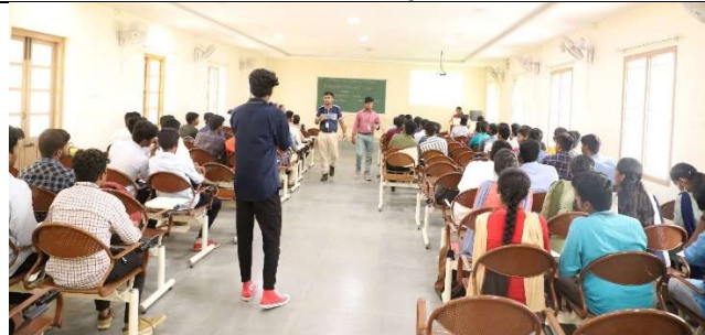
The arrangements & Spreading groups, instructions (2 per team)