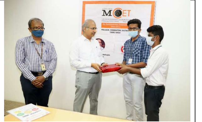
Third Prize Winners