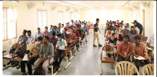
Round - 1