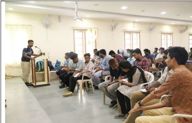
Round - 2