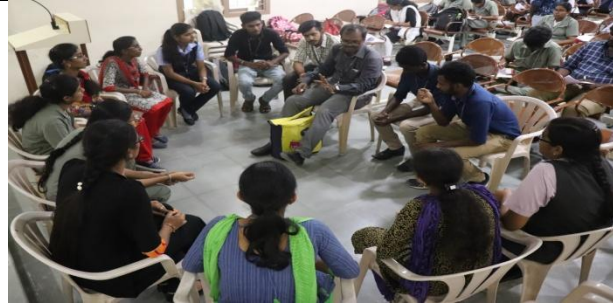
Citizen Consumer Club Office Bearers meeting