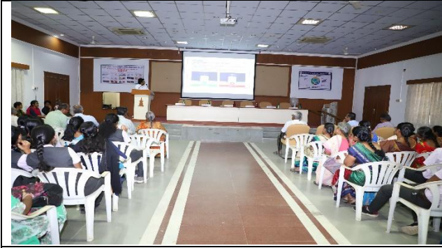
Students and self-help group's Participation - BharathRathnaC. Subramaniam Hall - View 1