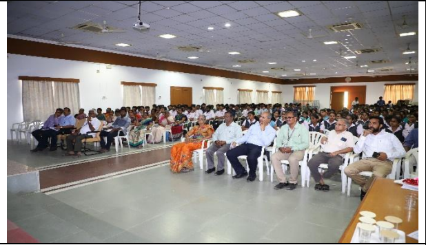
Students and self-help group's Participation - BharathRathna C. Subramaniam Hall - View 2