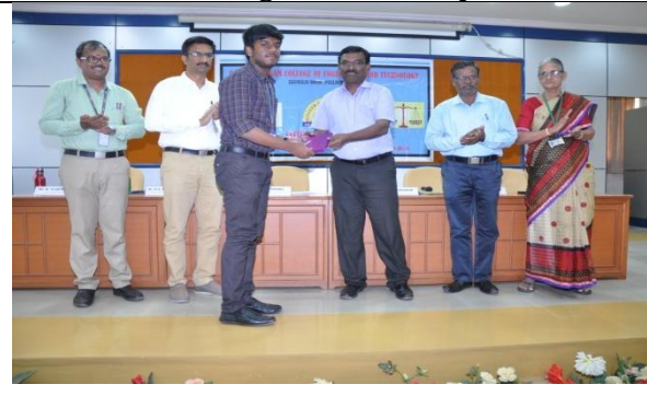
Prize Distribution - Essay Competition Winners