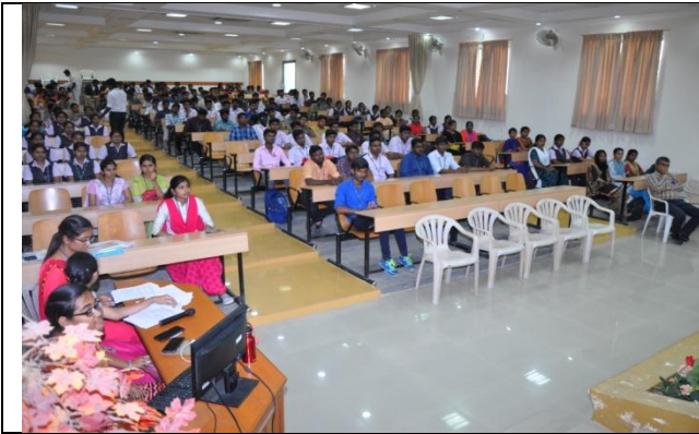
World Consumer Rights Day 2019 & Food Day 2019 Celebrations: 27.09.2019 Students' Participation - Mechanical Seminar hall