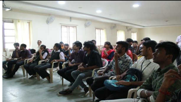
Find and Connect event:12.09.2019 (Round 3)