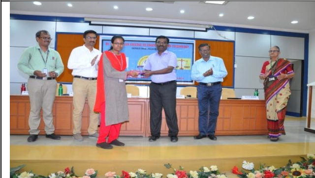
Prize Distribution - Drawing Competition Winners