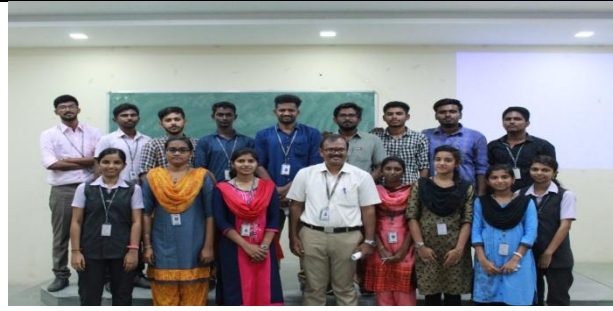
Citizen Consumer Club Office Bearers for the academic year 2019 - 2020