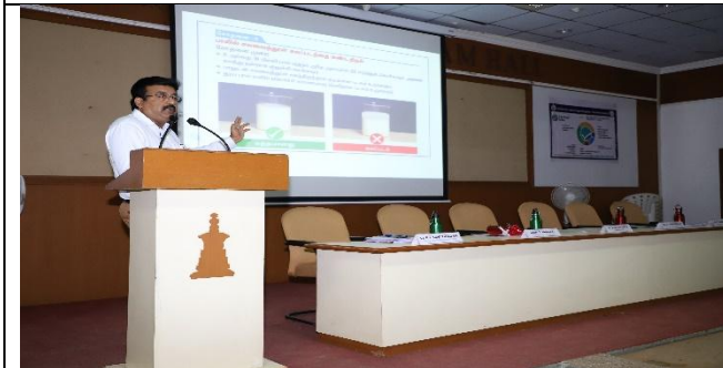
The chief guest is explaining to find the adulteration with rapit test in food products by power point presentation.