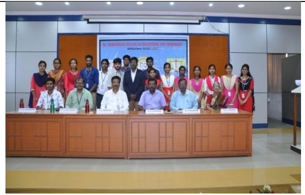
Group Photo - Dignitaries and Office bearers, Food Day event 2019