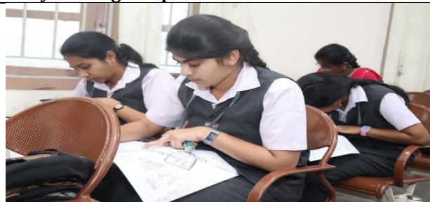
Drawing competitions: 27.09.2019