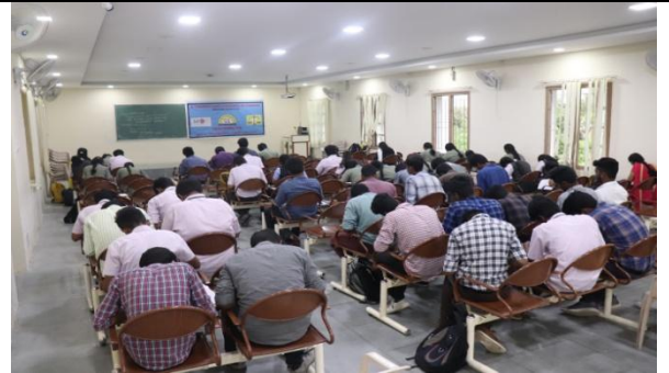
Essay Writing & Drawing competitions: 27.09.2019