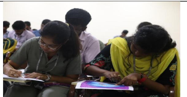
Drawing competitions: 27.09.2019