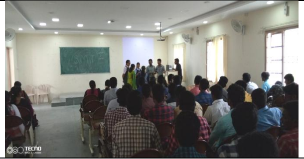
Fresher's meet for first year students 2019 - 2020 batch