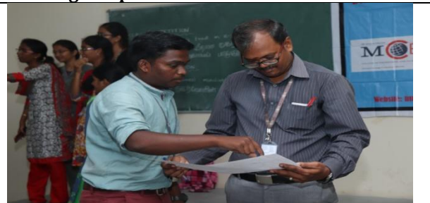
Students are explaining their drawings