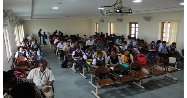
Find and Connect event:12.09.2019 (Round 1)