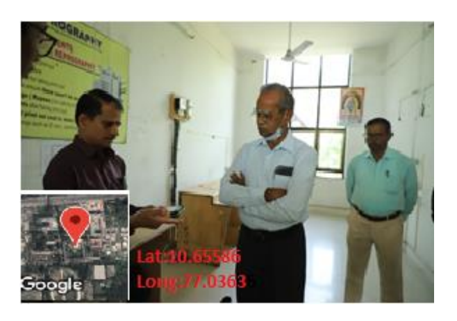
Startup Company by Mechanical Alumni (Campus to Home)