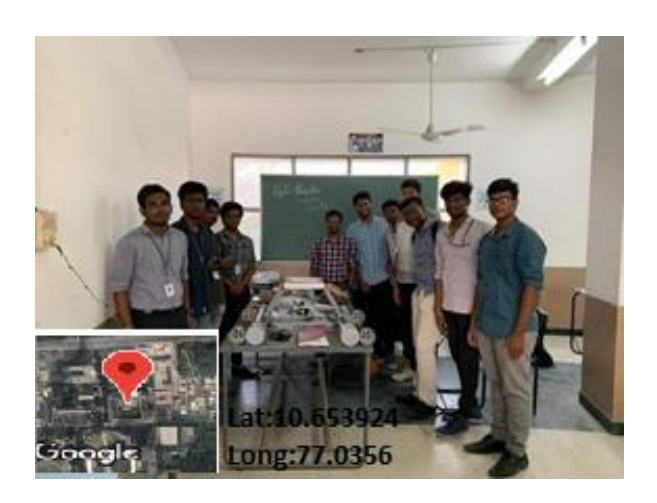
Startup by S.B.Pranav Kumar to develop UAVs serving to clean water bodies (Stark Tech)