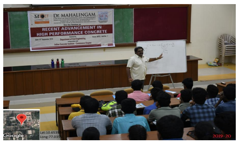
Technical seminar by Subject matter Expert to students