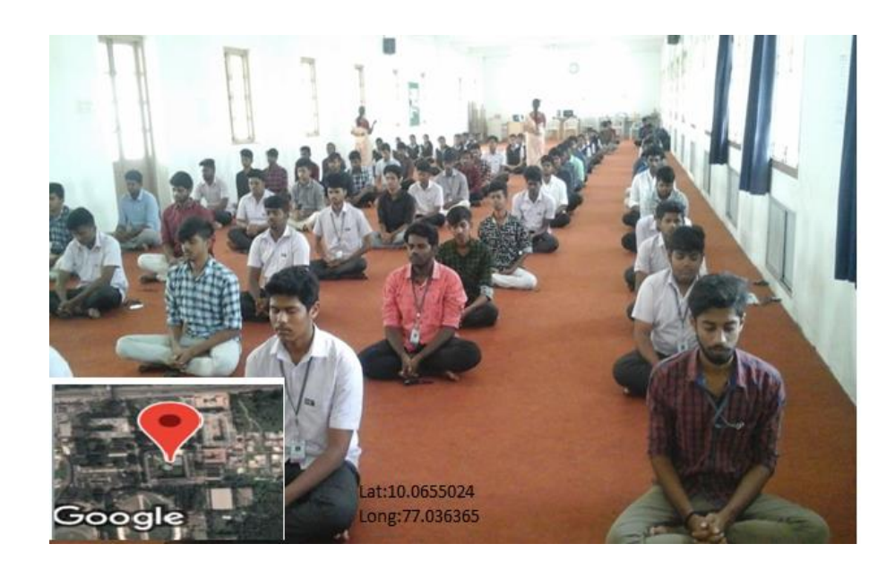
Yoga and Meditation performed by the students as a part of "Wellness for Students" Course