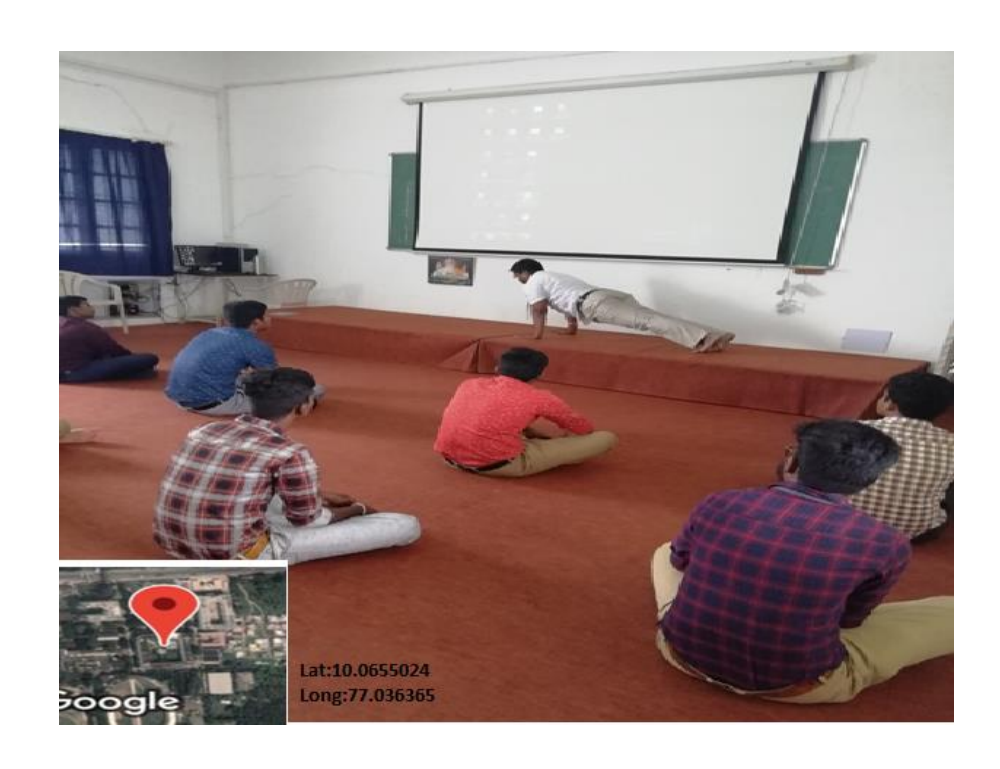
The Instructor giving instructions to the students for Wellness Course