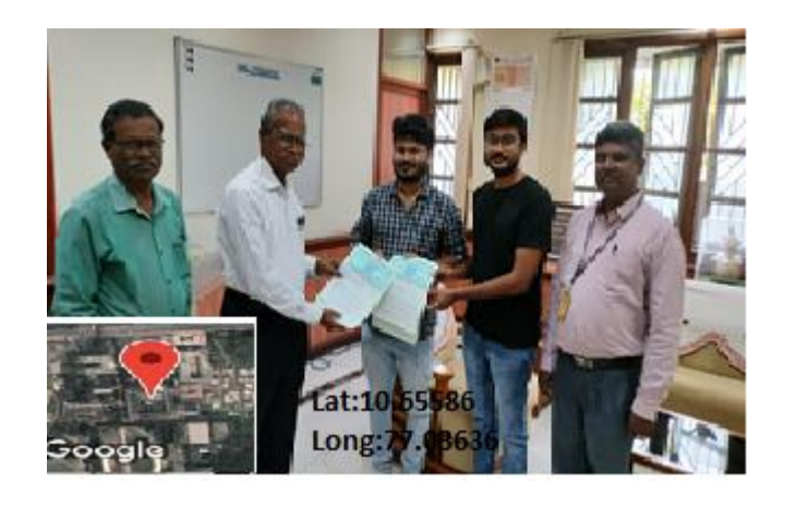
Alumni of MCET are founders of the startup Farm Yield Agri Products LLP