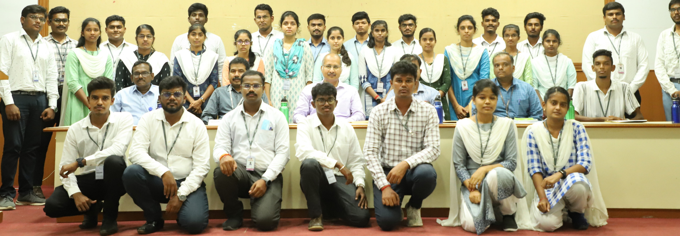
SGS Team - 2021-2022