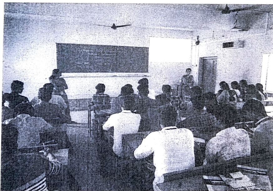
Students while participating in quiz event