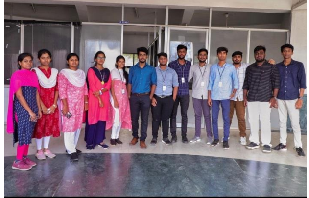
Brains of Tech