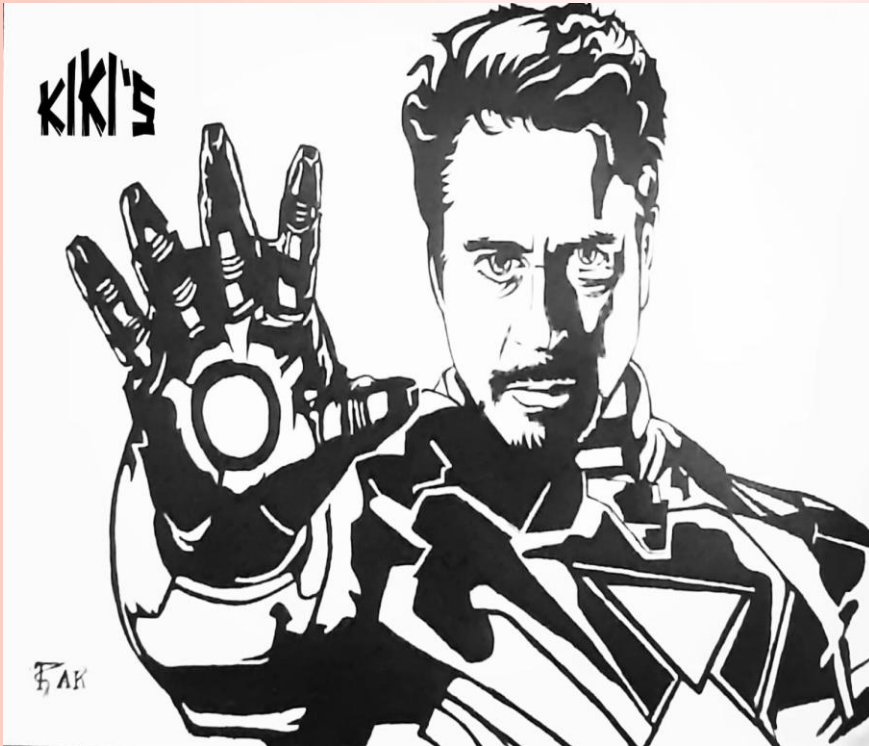
DHEENATH T III ECE B