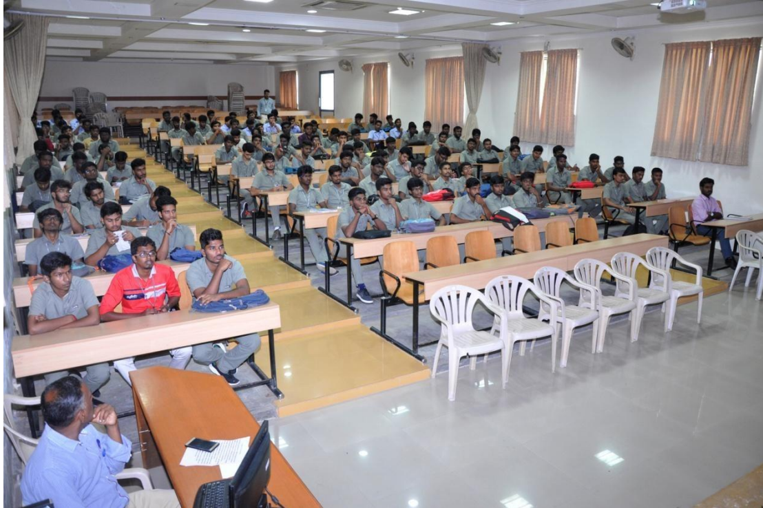
Glimpses of Guest Lectures